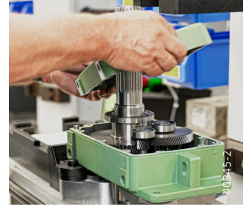
The DC-II gearbox is still manufactured in-house by Demag. This is the only way for us to meet our demanding quality requirement for the chain hoist.

Our production facility has been manufacturing crane and lifting equipment, and industrial drives in Wetter an der Ruhr for over 200 years. This centuries-long expertise in the development and manufacture of solutions for lifting loads is reflected in Demag's high understanding of quality.